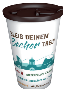
City of Mannheim

The „Bleib deinem Becher treu“ cup is part of the municipal climate protection campaign „Mannheim auf Klimakurs“.