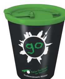
University of Münster