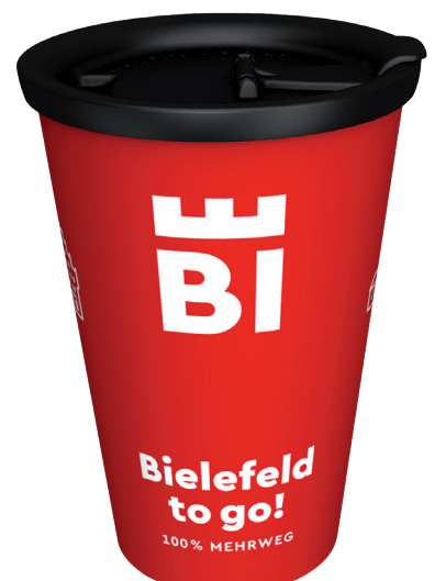
City of Bielefeld