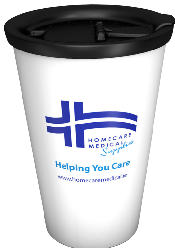
Homecare Medical Supplies

With the reusable Cups by ORNAMIN there are no limits to your creativity. They can be customised with an individual and dishwasher safe decor. Here are some examples of already realised projects. For more information go to www.ornamin.co.uk/references .